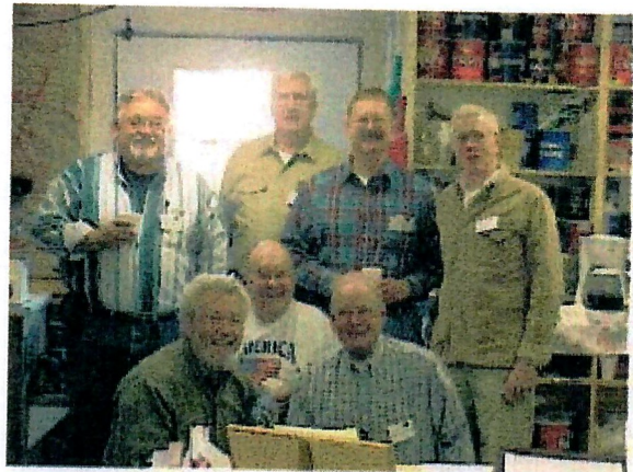
CAW and AVW members.