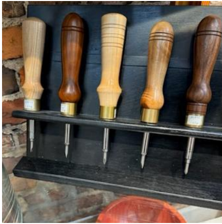
Multi-purpose screwdriver kits