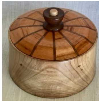
Keep sake boxes