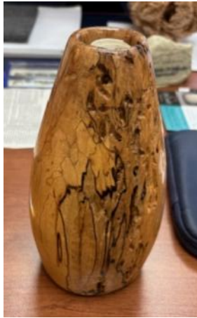
Tea light vases