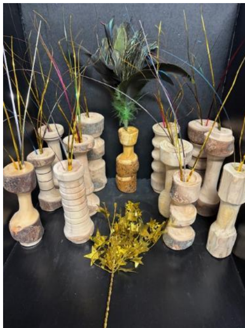
Bud vases and party highlights