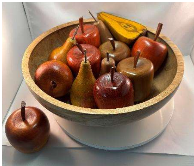
example – apples in a bowl