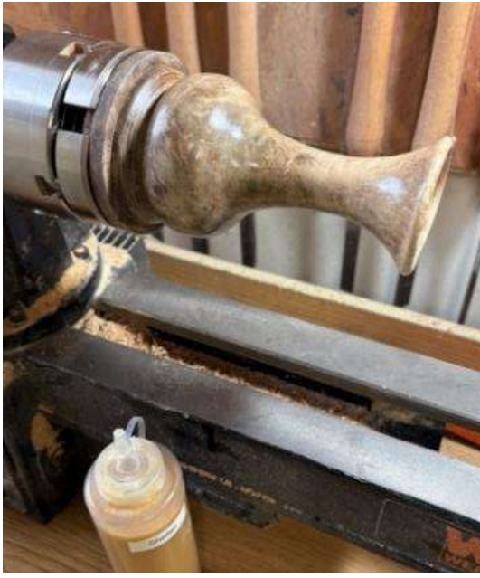
example – twig pot