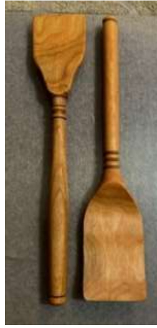
example - kitchen spatulas