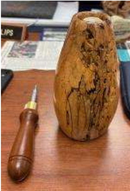
example - screwdriver kit or vase